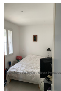
Saint Jean de Malte - Aix en Provence