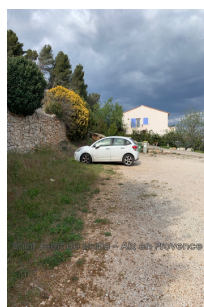
Aix en Provence