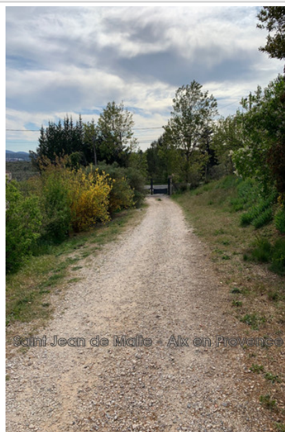
Saint Jean de Malte - Aix en Provence